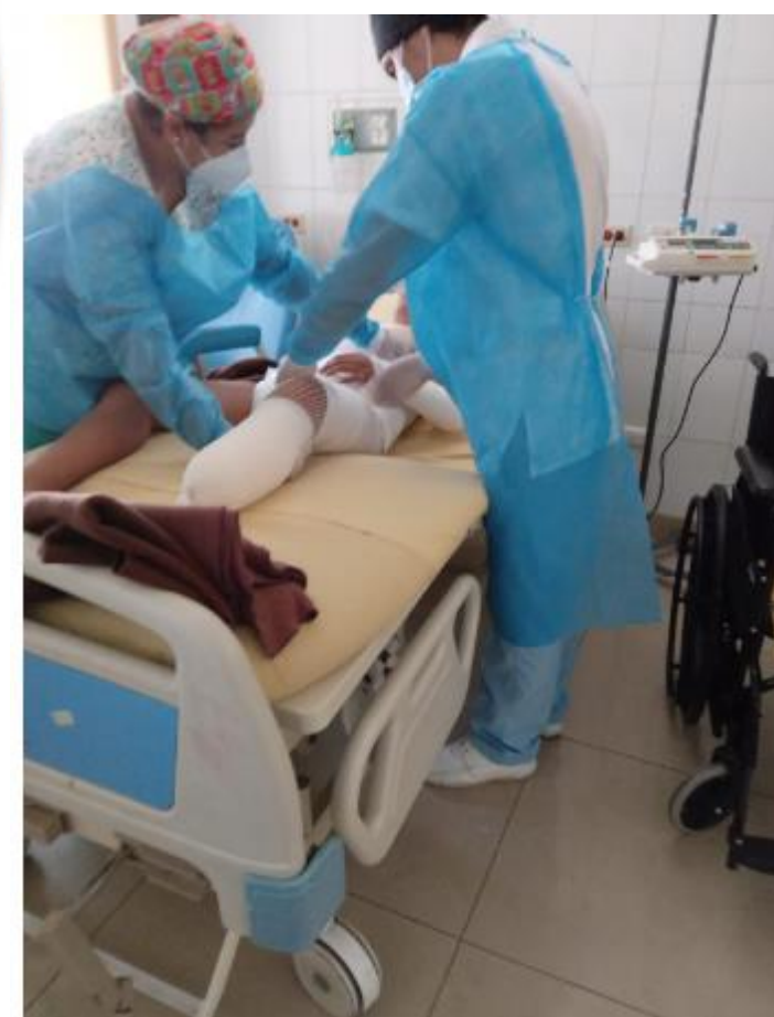
Figure 1. Complications